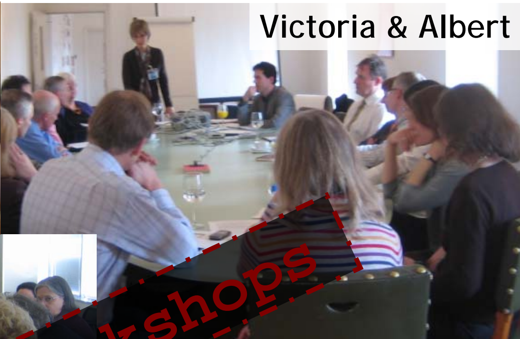
Victoria & Albert