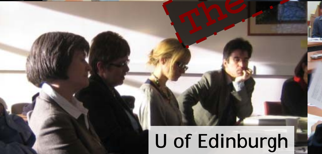
U of Edinburgh