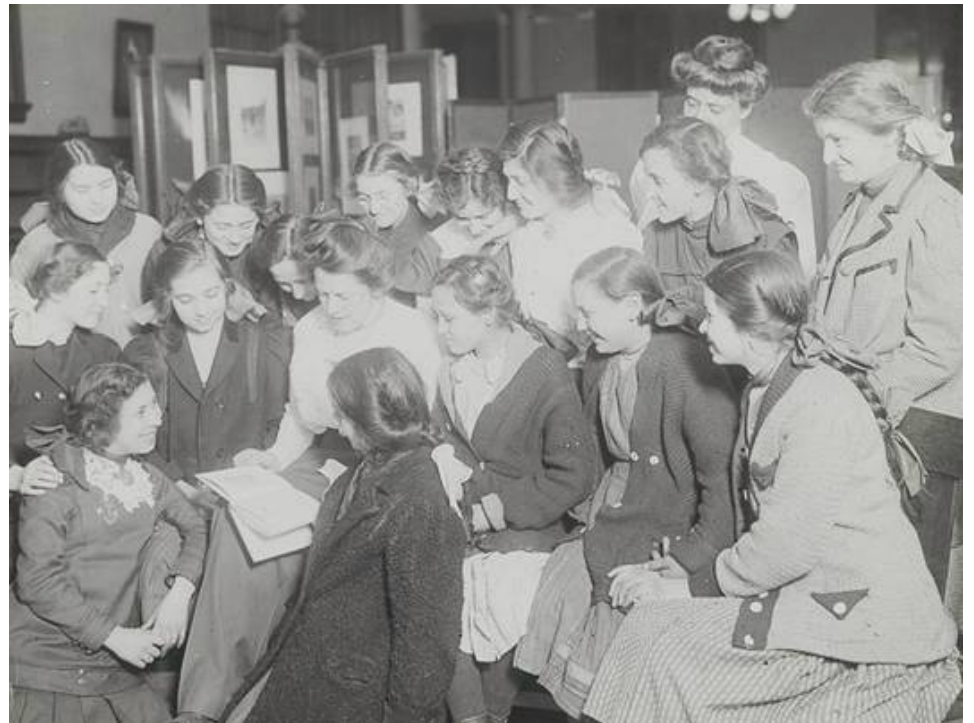
Rivington Branch, Story Hour: A Girl's Club Listening to a Story of Atlanta. Digital Image ID:1145780

A short history of libraries, archives and museums