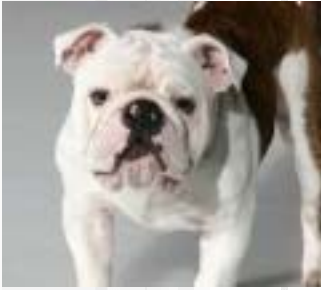
Handsome Dan XVII