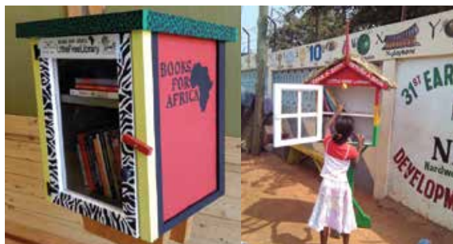
A girl borrows books from a LFL in Ghana.