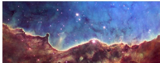
Hubble Space Telescope image of the Carina Nebula

This is the first in a series of blog posts exploring the evolving Open landscape, library roles and OCLC's place within it. This post provides a general overview of Open, sign-posting important categories as they relate to libraries and exploring motivations that draw libraries – and other stakeholders – into this ecosystem. Subsequent posts will describe OCLC's engagement in the Open landscape and examine our distinctive position as a member-driven infrastructure partner.