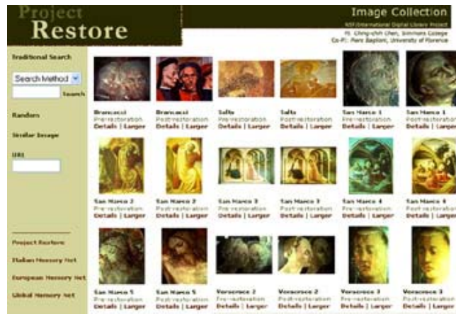
Fig. 7. Retrieved Pre- & Post-restoration Images

chemistry technology in restoration is summarized in several recent articles [16]. What is worthwhile to mention and demonstrated here is that the invaluable restoration images of the Baglioni group in Florence are being organized and presented in GMNet , known as Project Restore . Figure 7 shows the pre- and post-restoration images retrieved from this project, it is clear that these images together with the associated descriptive information are of substantial significance to art historian and art specialist and students.