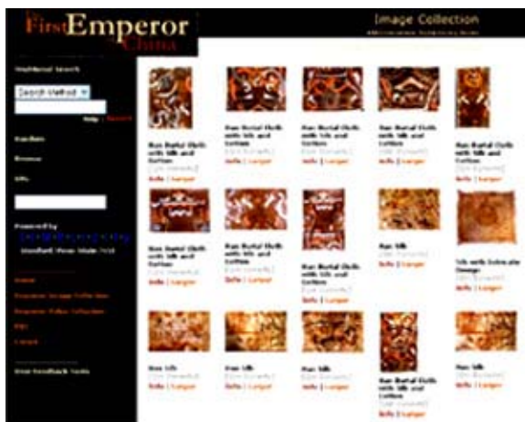
Fig. 4(left). Images of the same color, shape and pattern

On that screen, descriptive information of any chosen image can be provided if asked or several derivatives of the image can also zoomed as shown in Figure 5.