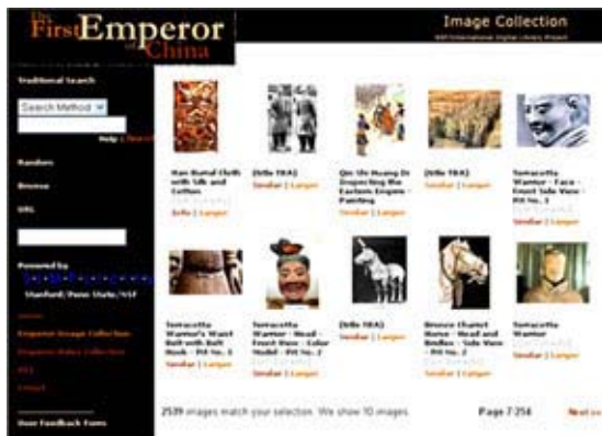
Fig. 3. Random images show when user selects the image database

retrieval by metadata fields as the real-time online demonstration will shown. Figures 3-5 are shown here to demonstrate how this kind of retrieval technique can help to stretch the