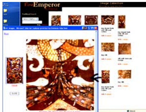
Fig. 5. Chosen image is further enlarged

To overcome the problem related to “copyright” and intellectual property issues, all images larger than the thumbnail size would be displayed with a dynamically generated digital watermark of the image owner. This has facilitated the contribution of image content resources to GMNet .