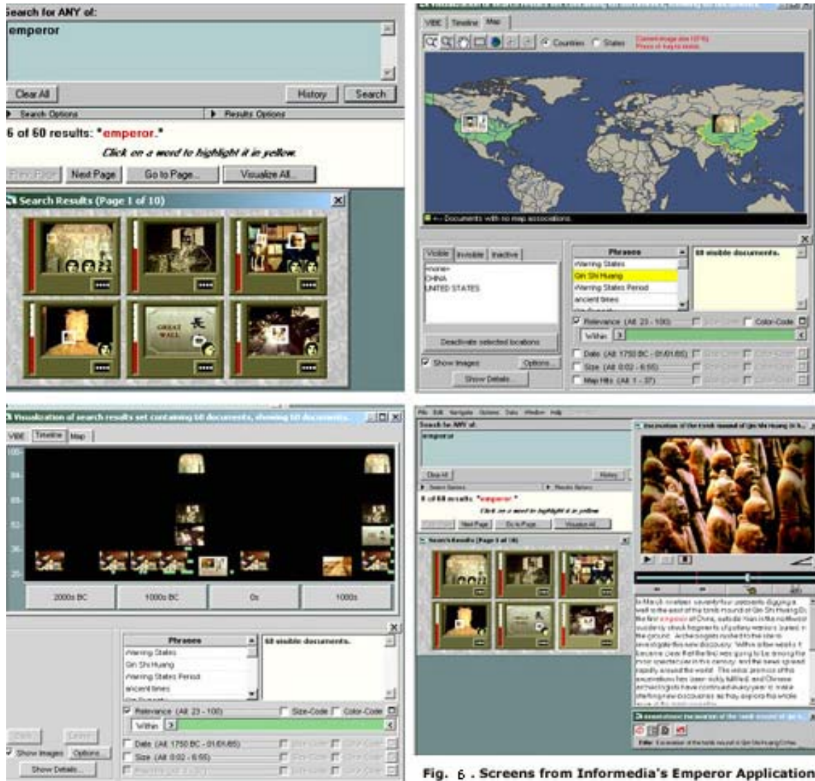
Fig. 6 . Screens from Informedia's Emperor Application

with that word have been identified and retrieved, these can be visualized in timeline as shown in the lower left. Map is shown in the upper right, and when one of the video is chosen, the video will play in the upper right of the lower right screen, and below that, the actual text will also be displayed with the word “emperor” highlighted in red.