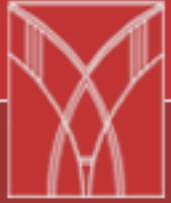
Table of Contents for Recent Issue