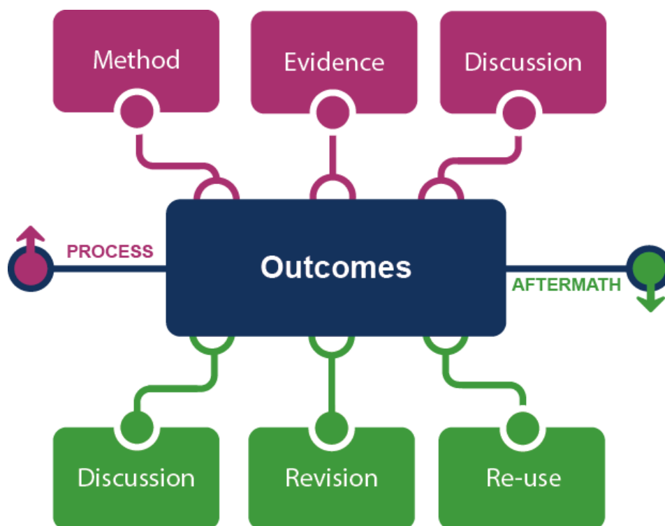
Figure 1. The Evolving Scholarly Record

Published outcomes from scholarly inquiry, such as journal articles or monographs, are still the coin of the realm for academic contribution and discourse, and are therefore placed at the center of figure 1. But in addition to these traditional outputs, the scholarly record potentially includes other categories of material as well. Three of these categories belong to the process phase of scholarly inquiry—the activities leading up to the final published outcome. The Method category includes materials relating to the methodologies and tools used to produce the results of a particular research activity (e.g., computer programs, experimental protocols, survey instruments). The Evidence category includes materials that represent the “raw inputs” from which the findings reported in the published outcome are derived (e.g., data sets, survey responses, literature reviews). The Discussion category includes materials generated from scholars’ interactions with others that serve to sharpen and refine the ideas and findings reported in the published outcome (e.g., blog commentary, discussion lists, preprints).