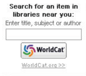
The search box

When genealogists search WorldCat through one of three available downloadable box widgets—for lists, keyword searches and traditional searches—they locate items cataloged in the collections of more than 10,000 libraries worldwide. If your library contributes its holdings to WorldCat and maintains a subscription to the WorldCat database